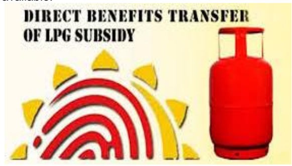
The expenditure on kerosene subsidies in 2010-11 was around Rs 19,600 crore out of which 38

According to official data the total food subsidy for the year 2010-11 was Rs 58,500 crore. The value is adjusted downwards by 30 percent to account for subsidies in the form of back-end costs, which are not consumer subsidies, for which exact data is not available.