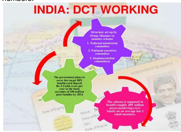
Challenges for DBT

In a review by the Prime Minister's Office on 5 August 2013, the minutes reported that two schemes dominated transfers through CPSMS - 83% of all transfers were for the Janani Suraksha Yojana and scholarships. Lack of computerized records for schemes to be linked to DBT was hindering rollout. The minutes show that out of 39.76 lakh beneficiaries who ought to have been covered under various schemes, only 56% had bank accounts, 25.3% had both bank accounts and aadhaar numbers, but only 9.62% have bank accounts seeded with aadhaar numbers.